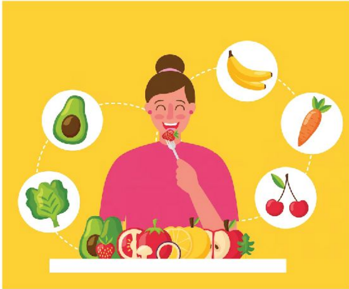
Eating Veg & Fruits